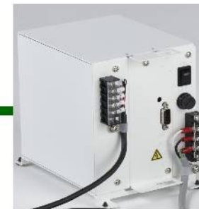
Power supply box