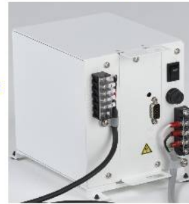
Power supply box