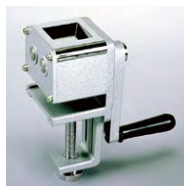
sample crusher (TQ-100)