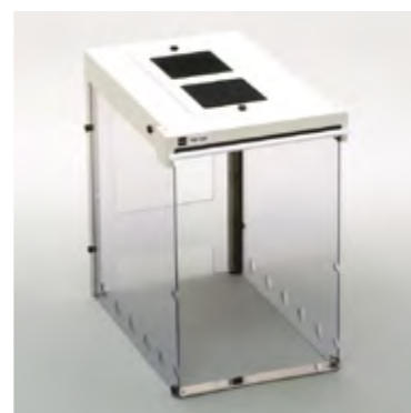
deodorizing windshield (FW-100)