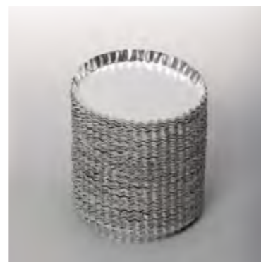
sample alminum sheet